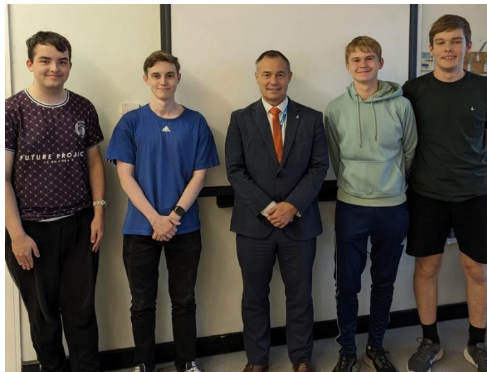
Sixth Form Senior Team