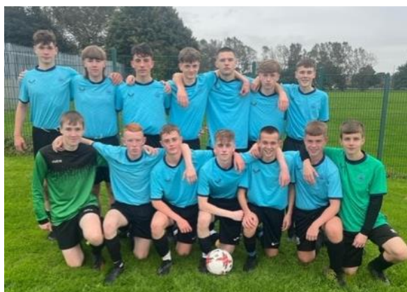
Year 11 Boys Football Team

We have also had a range of sporting success recently and are proud of all students who have taken part and those who have signed up for extra-curricular opportunities.