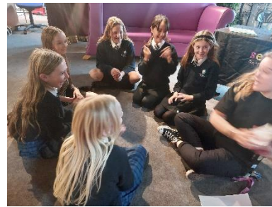
Fun group activities