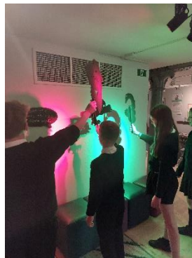
Exploring the exhibitions