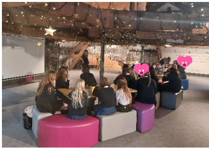
Creative Writing Workshop

A group of Year 7 students had a fantastic day at the amazing Seven Stories – The National Centre for Children’s Books. The students took part in roleplay, creative writing workshops, had a white glove experience where they could handle original manuscripts and illustrations and we had the whole building to ourselves to explore the incredible exhibitions. As you can see from the photos below the students really enjoyed their day. Thank you to the team at Seven Stories for making it such a memorable day.