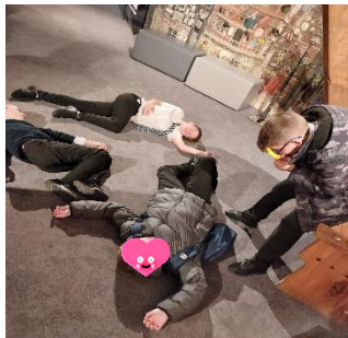
Roleplay to release our imagination