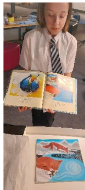
Original art work