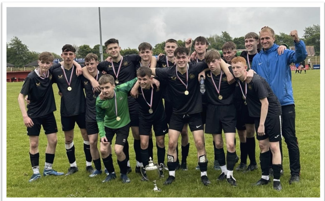
The victorious GSHS Year 11 boys football team

Congratulations to the Year 11 boys football team who won the county league cup final against John Spence. In a tight game, where they went 1-0 down, they eventually won 3-1, which proved a fitting end to a talented team's time at George Stephenson.